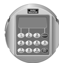
SecuTronic combination lock with finger scan Ranger E FS Models Royal E / ES / EE Models OfficeLine & OfficeDoku E Models