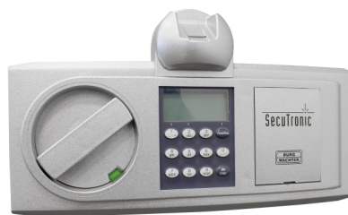
SecuTronic combination lock with finger scan Diplomat E Models Karat E FS Models