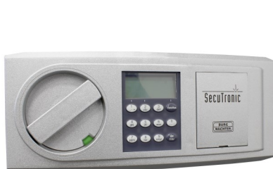
SecuTronic combination lock Karat E Models

These instructions apply to safes fitted with the SecuTronic locking system: